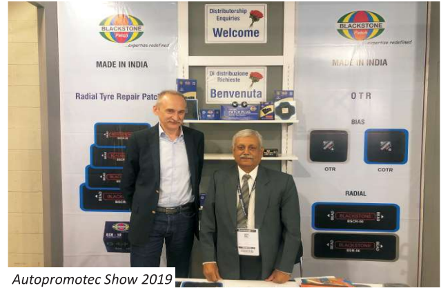
Autopromotec Show 2019