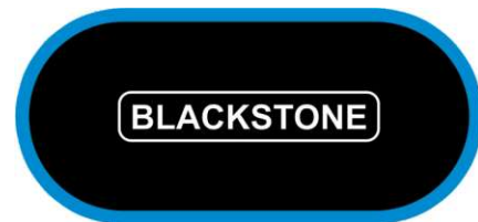
Chemical Cure (Oval)