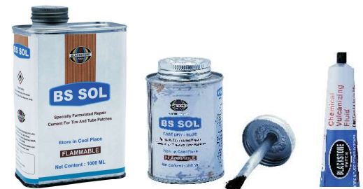
Chemical Vulc Fluid