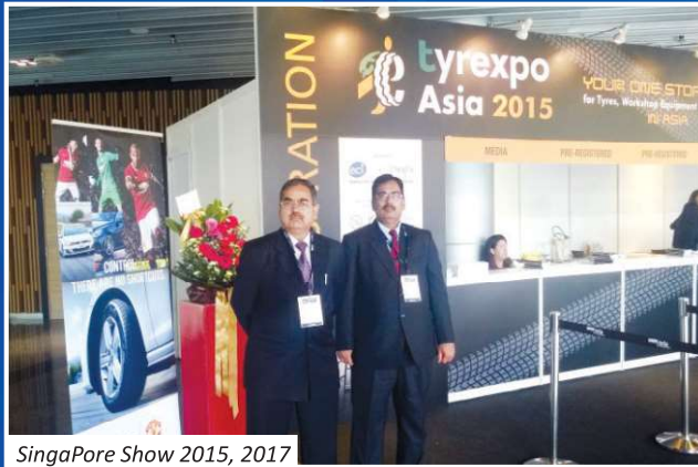
Singapore Show 2015, 2017