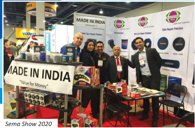
Sema Show 2020